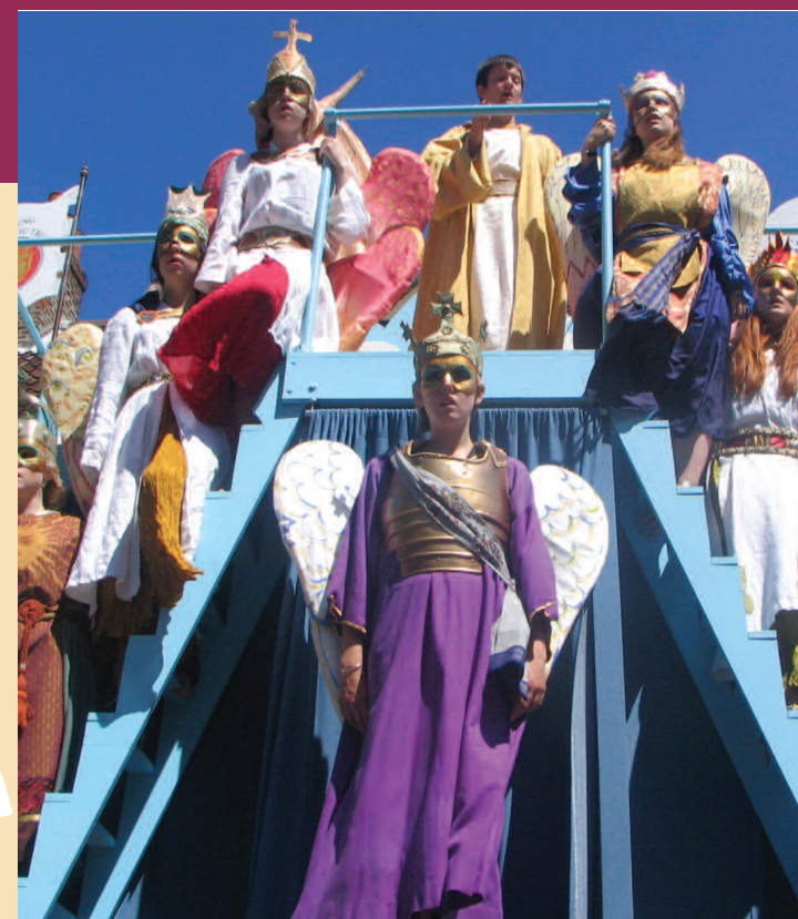
'The Fall of the Angels' Young York Civic Trust's Production 2006

Organised by the Seven Guilds in association with the Centre for Medieval Studies, University of York